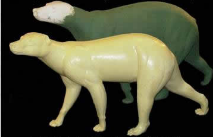
#BL7 - 4¾ x 17½ x 35 x 47 - $304.15

Designed to walk on carpet, it balances perfectly!