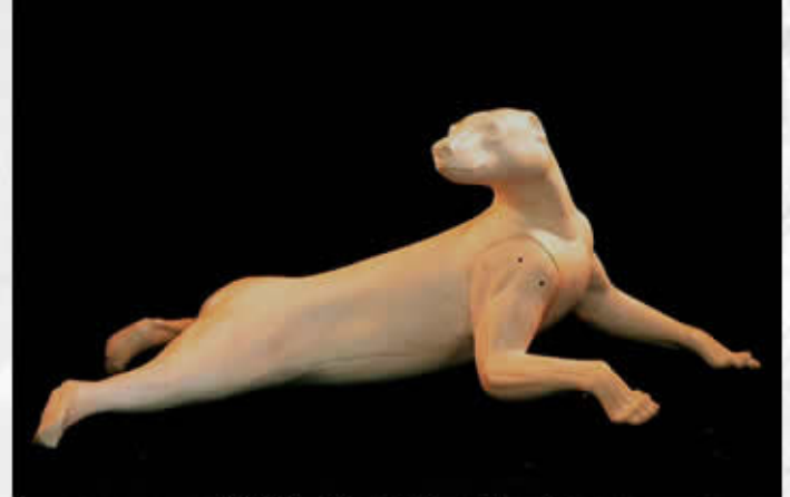
#BL4 - 5 x 17½ x 35 x 48 $304.15

Another bear form, where the floor can be the base.