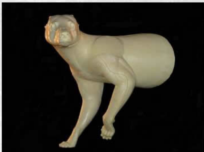
#BB 45/90 - 5 1/4 x 21 x 42