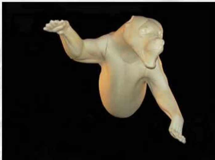
#BCH3 - 4 1/2 x 16 1/2 x 31 - $134.50