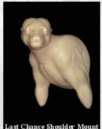
Last Chance Shoulder Mount