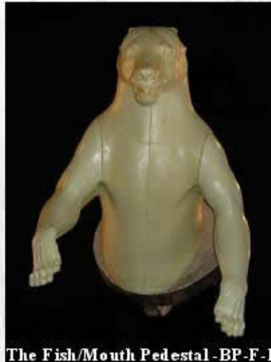
The Fish/Mouth Pedestal - BP-F-1