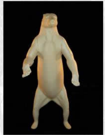
#BL8 - 5½ x 23½ x 46 x 61 $379.95