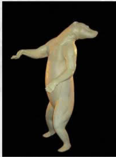
#BL5 - 5 1/8 x 21½ x 42 x 57½ $345.25