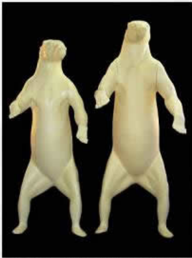
#BL6 - 4¾ x 17½ x 35 x 49 $304.15