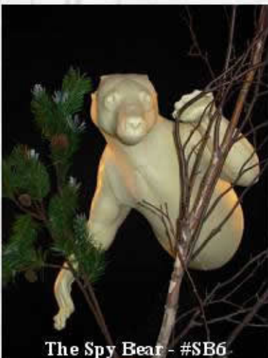
The Spy Bear - #SB6